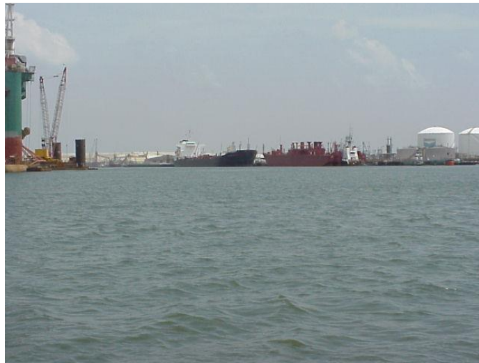
Figure 1. Photo of Bayou Casotte in May 2001

Bayou Casotte is on the Mississippi 1998 Section 303(d) List of Waterbodies as evaluated due to priority organics, which MDEQ has modified to be phenol to reflect the original pollutant of concern. It was originally listed due to the findings of the Pollutant Transport in Mississippi Sound Study (Lytle and Lytle, 1985). Elevated levels of phenol were measured in the sediment of upper Bayou Casotte. Several industrial facilities were discharging into Bayou Casotte during the 1985 study and continue to do so today. Even though the majority of the elevated phenol sediments identified in the 1985 study were “located near industrial dump sites”, a current source assessment and review of all permitted outfalls into Bayou Casotte did not identify any current sources of phenol. In addition, several facilities have made improvements in treatment or modifications to their facility grounds that eliminated outfalls to Bayou Casotte since the 1985 study.